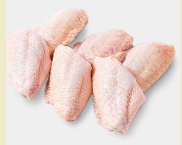
wing 2nd joint