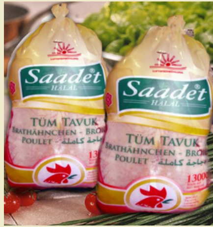
polyethylene bag packing