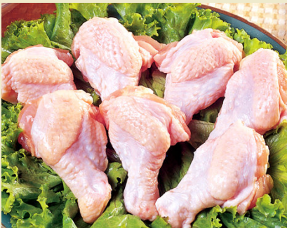
Wing 1st joint